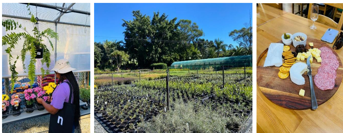
Figures 13. Day one of the pre-conference tour. Visiting nurseries and ending the day with wine tasting and cheeseboard.

and had some refreshments while touring the beautiful nursery. Following that visit, we explored two more nurseries that grow plants for landscape trade and had a delightful lunch paired with wine tasting and a cheese board ( Fig. 13 ). The day ended with a lovely Mexican dish and engaging in conversations with fellow delegates.