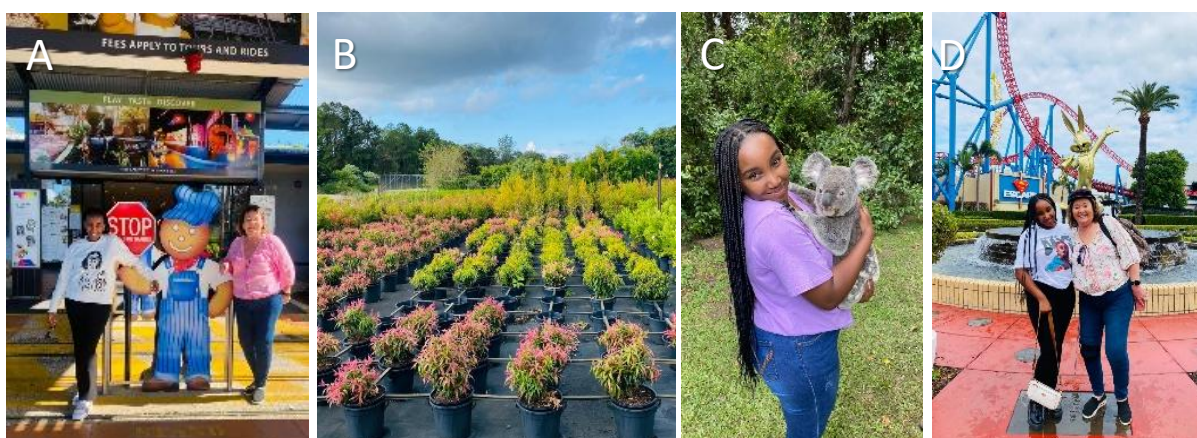
Figure 16. A) The Ginger Factory. B) Nursery visit. C) Australia Zoo and D) Warner Bros. Movie World.

and I got to taste a variety of ginger delicacies ( Fig. 16A ), and one more nursery visit where we were given an interesting tour by the inspiring Zoe ( Fig. 16B ). One of my highlights included visiting two iconic attractions: Australia Zoo and Warner Bros. Movie World ( Fig. 16C ). The visits provided a mix of wildlife conservation education and entertainment, offering unique experiences that highlighted both Australia's natural heritage and its thriving entertainment industry.