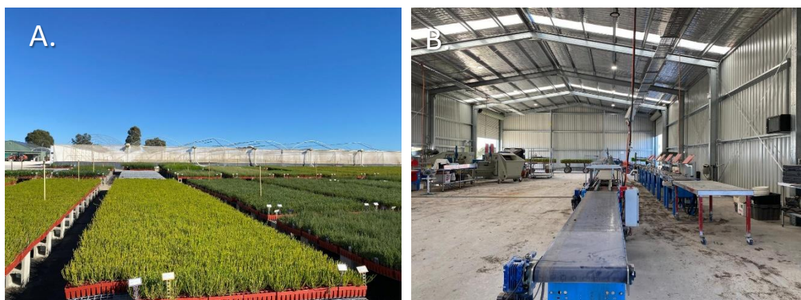
Figure 5. A) Large scale propagation unit at Plantrite nursery. B) Nursery machinery at Plantrite.

Having a host like Mr. David Hancock was an extreme honor for me, and our last nursery visit was a privilege as I got to see Natural Area Nursery. I was given a tour of the nursery and a history of it. Recently moved to a new area, Natural Area Nursery has a reputation for producing quality plants for restoration, revegetation, and landscape around Perth and Western Australia (Figs. 6 and 7).