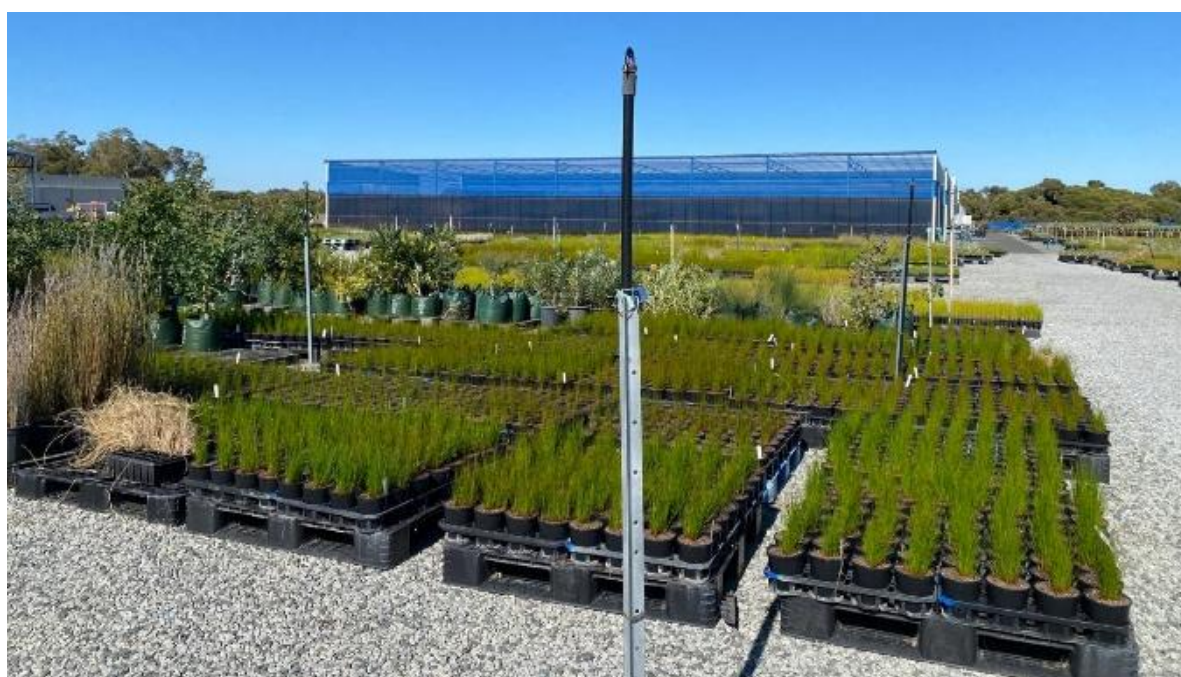
Figure 6. Pellet trays at Natural Area Nursery.

I got to learn about all the fascinating restoration projects Mr. Hancock has been involved in and it was inspiring to see the relationship he has with the staff. I got to see a variety of native Australian plants and learned about water efficiency and some challenges presented during drought seasons.