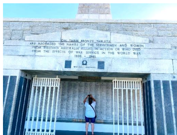
Figure 9. King's Park memorial.

We then took a drive to Kings Park, which was one of the most beautiful places I have seen (Fig. 9).