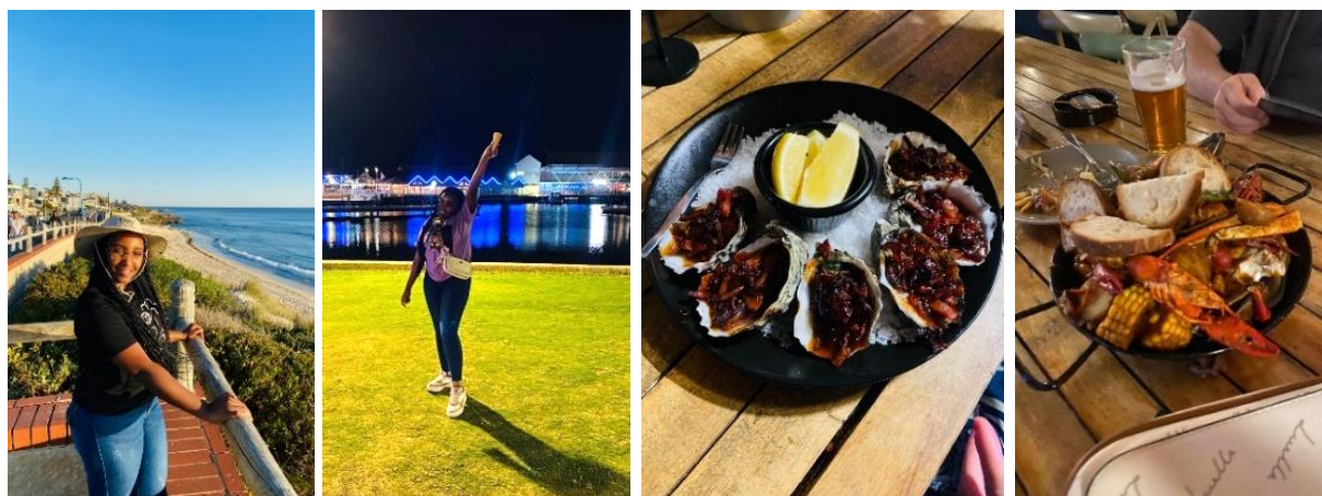
Figure 11. Visiting North beach and having a seafood buffet with Natural Area Nursery staff. Exploring the beauty at the coast and tasting indigenous foods.

After a long day of fascinating visits and tours, we took a drive to the north beach where I went to my accommodation in preparation for a night out with some of the young people from Natural Area Nursery. Driving there we stopped at a few spots for pictures, and I got to see some of the restoration projects Mr. Hancock has done around the North Beach. The night in Perth ended beautifully with local seafood, music, drinks, and good company ( Fig. 11 ).