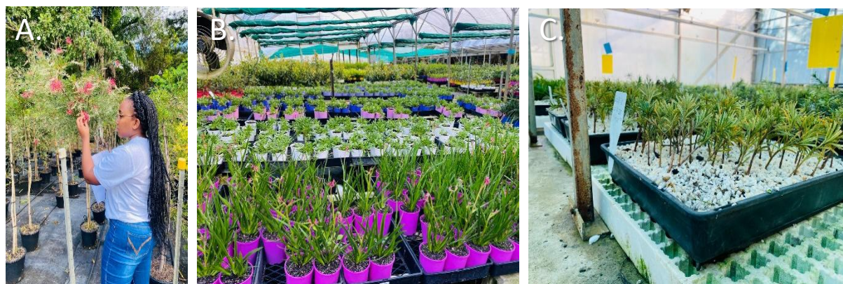
Figure 14. A) Nursery visit. B) Using different colour pots in a production nursery. This could also be done in South Africa for ease in plant identification. C) Grevillea cuttings stuck in perlite.

ronmentally friendly practices, such as integrated pest management (IPM), which reduces chemical inputs while maintaining high yields. These methods could be replicated in South Africa's nurseries. Our day ended with a buffet of prawns, fresh oysters wine, and good conversations exposing me to the beauty of the coastal town.