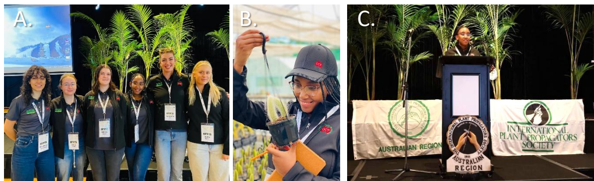
Figure 15. A) Meeting fellow six-packers. B) Plant identification during a nursery visit. C) Presenting at the IPPS conference in Ballina, New South Wales.

the event also offer opportunities for ongoing collaboration and exchange of best practices and I had the opportunity to present about my visit to Australia which was an amazing opportunity for me ( Fig. 30 ).