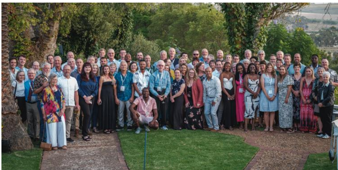
Figure 1. IPPS delegates in Stellenbosch.