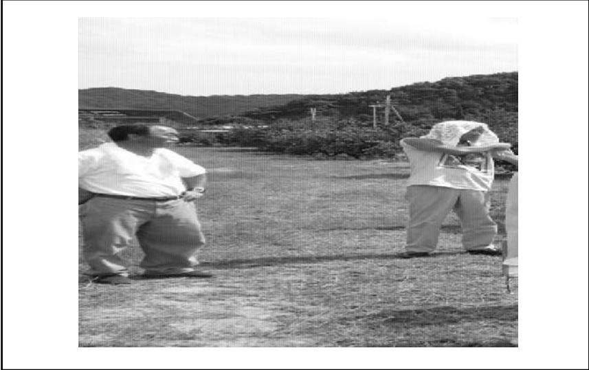
Figure 3A. Citrus germplasm at the experiment farm of Kinki University.