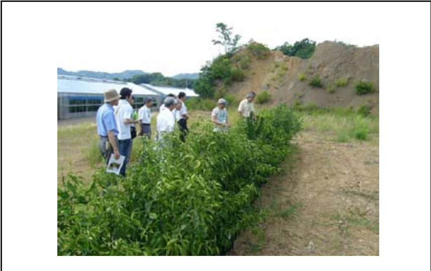
Figure 3B. Nursery field of citrus plants. Plants are grafted on trifoliate orange rootstock.