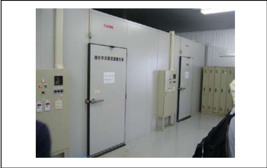
Figure 1C. The incubator for grafted plants. Temperature, humidity, and light intensity in the incubator are automatically regulated. Grafted plants are acclimatized for a couple of days in the incubator before shipping.