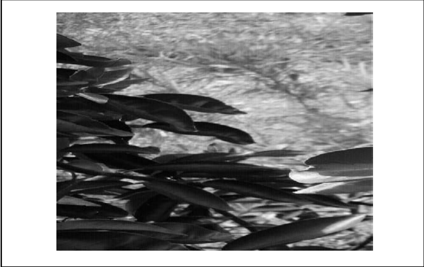
Figure 3C. Variegated fruit (chimera?) of satsuma mandarin found in the collection. The taste of fruit is absolutely satsuma mandarin. Some variations of variegated types are found.