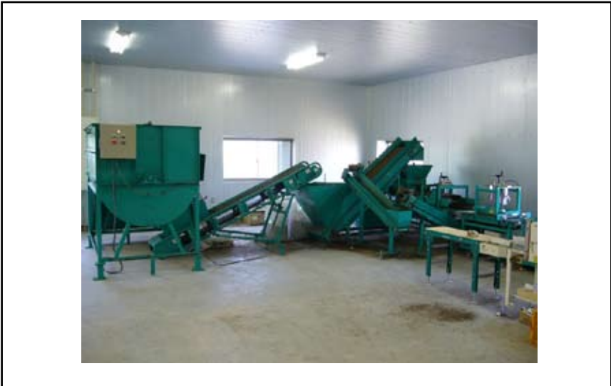
Figure 1B. Soil and compost mixer at Koike Nursery Co. Ltd.