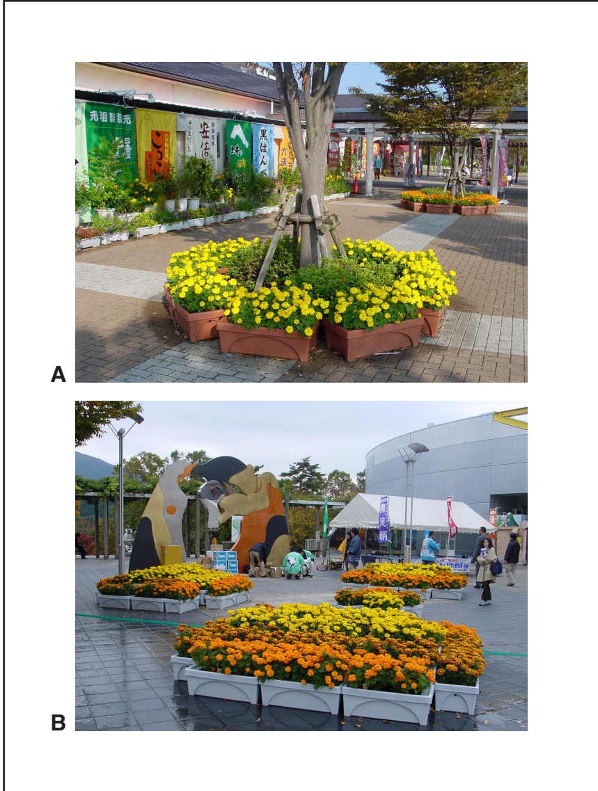
Figure 3. Flower displays of Hanasaki-RAKUDA in front of service stations on expressway in Japan (Area in Shizuoka prefecture). (A) Makinohara service area and (B) Ashigara service area.