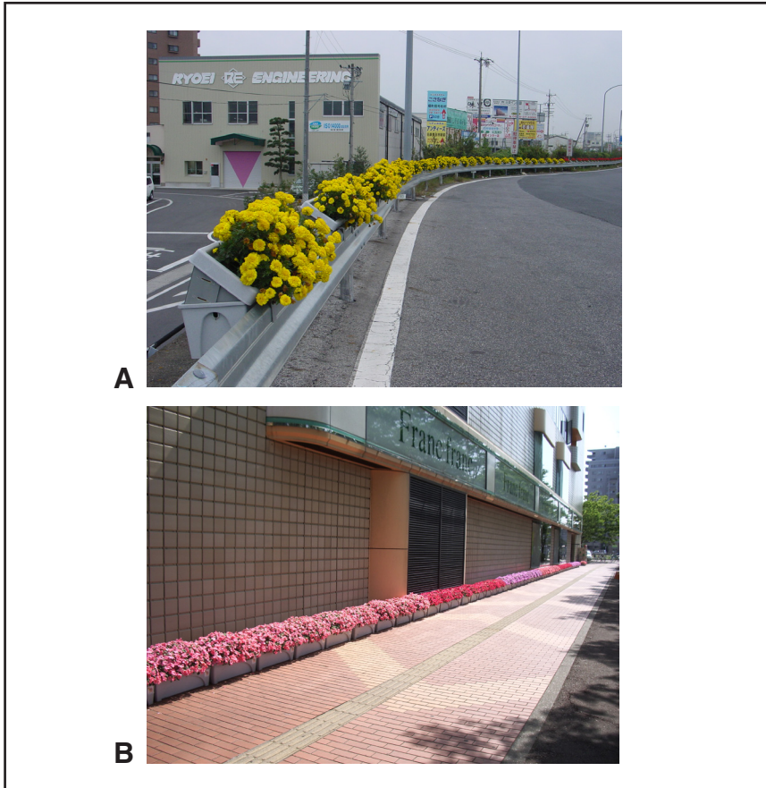
Figure 2. Flower displays of 'Hanasaki-RAKUDA' on roadside. (A) In front of the Japan Railway Niigata Station south exit (Niigata prefecture) and (B) Toyota city, Aichi prefecture.