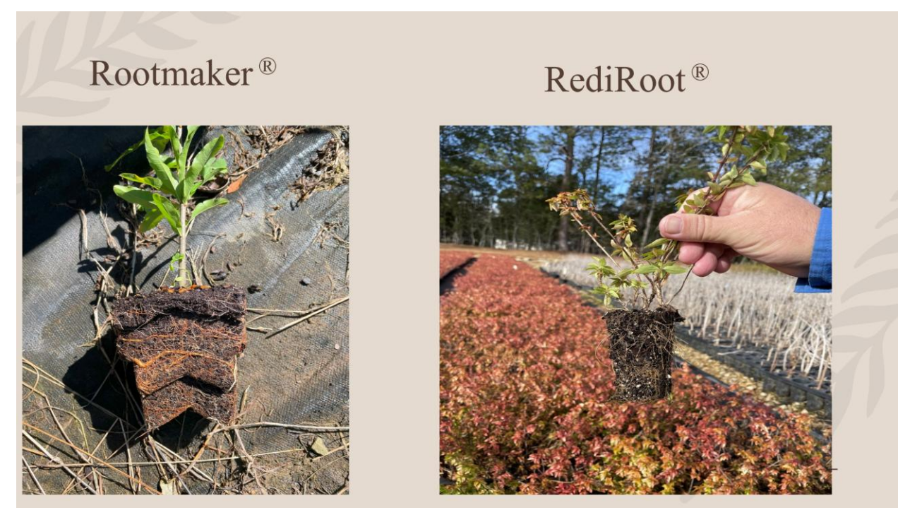
Figure 7 . (left) Rootmaker<sup>®</sup> and (right) Rediroot<sup>®</sup> are other commercially available airpruning, liner container systems.