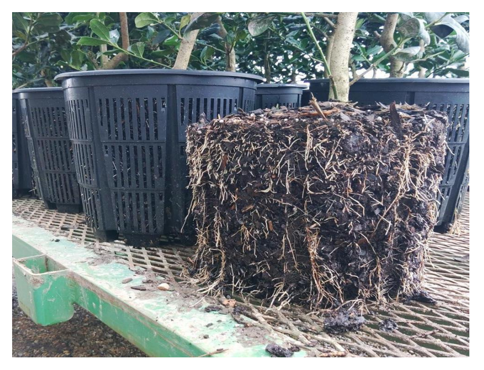
Figure 4 . Air-root pruning can also be done with larger containerized plants. Notice the fibrous white roots.