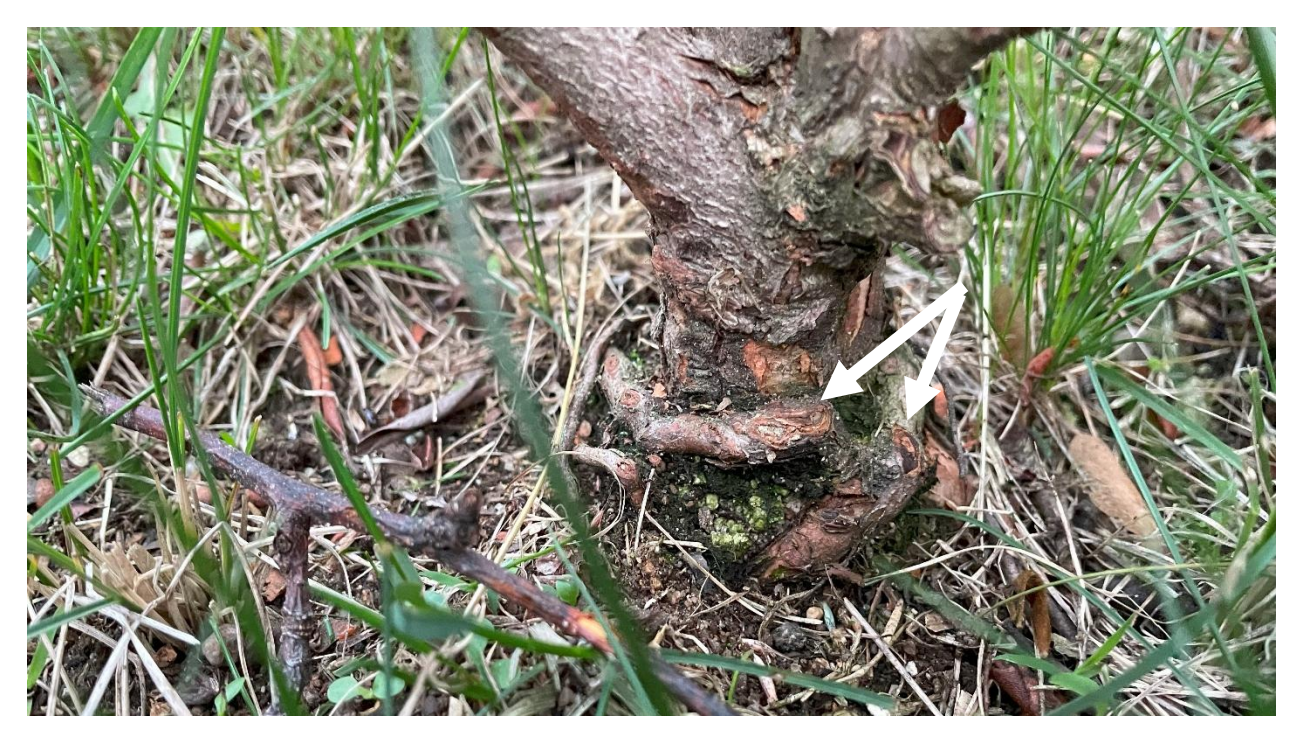
Figure 1 . A problem with coarse rooted woody taxa can be root girdling (arrows) that leads to an undesirable, poor-performing plant in the landscape.

Specialized containers/pots that air root prune can redirect root architecture – leading to a more fibrous, easily transplanted, desirable plant. It all begins in propagation with air-pruning of primary roots of the liner crop. Air root pruning has also been beneficial for greenhouse-grown vegetables, herbs, and flowering plants.