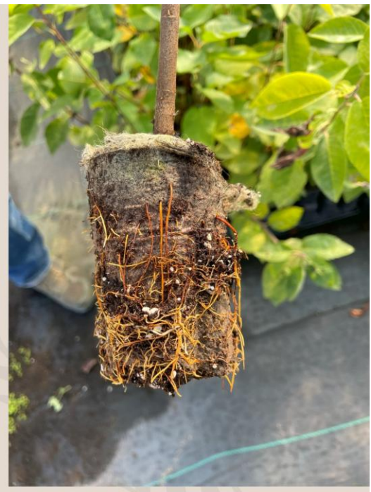
Figure 2. In air-root pruning the liner pots redirect roots to leave the growing media and desiccate which stimulates greater branching of new roots.