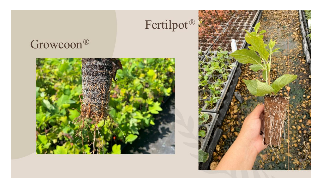
Figure 6 . (left) Growcoon is a unique cutting and seed plug holder, composed of a biodegradable material that holds the media, and (right) Fertilpot propagation cups are for use in our RediRoot<sup>®</sup> propagation trays for the purpose of reducing transplant shock without compromising air-pruning technology.

Air-pruning is an important component in modern propagation and production systems.