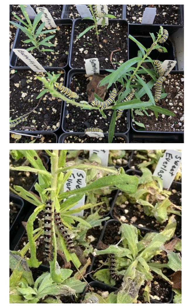
Figure 4 . Monarch butterfly on Asclepias (above) and American Lady (lower) caterpillars on sweet everlasting (Pseudogna-phalium obtusifolium) production material.

Natives in Harmony Nursery was established to address some of the shortages of endemic native plants that have been forsaken by the mainstream horticultural world ( Fig. 5 ). We do extensive research and scouting for native populations with a keen eye towards the collection of seed for propagation. We take care to ensure that sufficient quantities of seed are left in place to allow the endemic population to prosper.