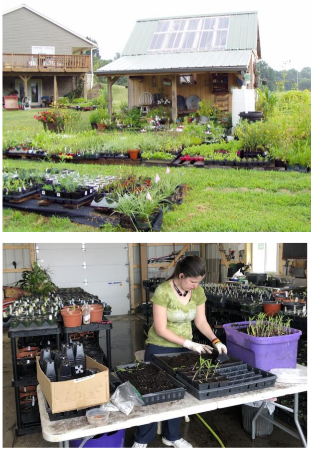
Figure 5 . Production facilities for propagation of native species.

As our endeavors increased, we saw a need for closer observation and a means for harboring certain species so that they would not meet the fate of the Silene regia .