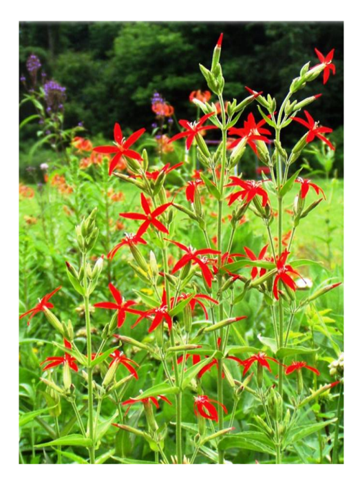
Figure 2 . Royal catchfly before being eliminated by dumping debris on the site.