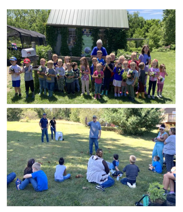
Figure 10. Educational outreach.

This concept also applies to prairies and prairie management. The quickest way to really "see" a plant is to go look for yourself. Nothing surpasses on the spot observation and analysis. If you want to know how a plant grows, go find where and how it grows. It could well be an eye opener and will assist greatly with learning how to produce it.