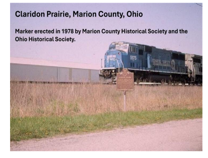
Figure 1. Claridon Prairie.

Many endemic native plants abound around Trella Romine Prairie with some being quite rare. Asclepias tuberosa of various colored forms, Echinacea purpurea, Bap tisia alba , Silphium species , and numerous grasses can be found in this environment. It is important to know that plants are found in communities and rarely is a plant an island, the community aspects are varied but one key ingredient is a shard microflora