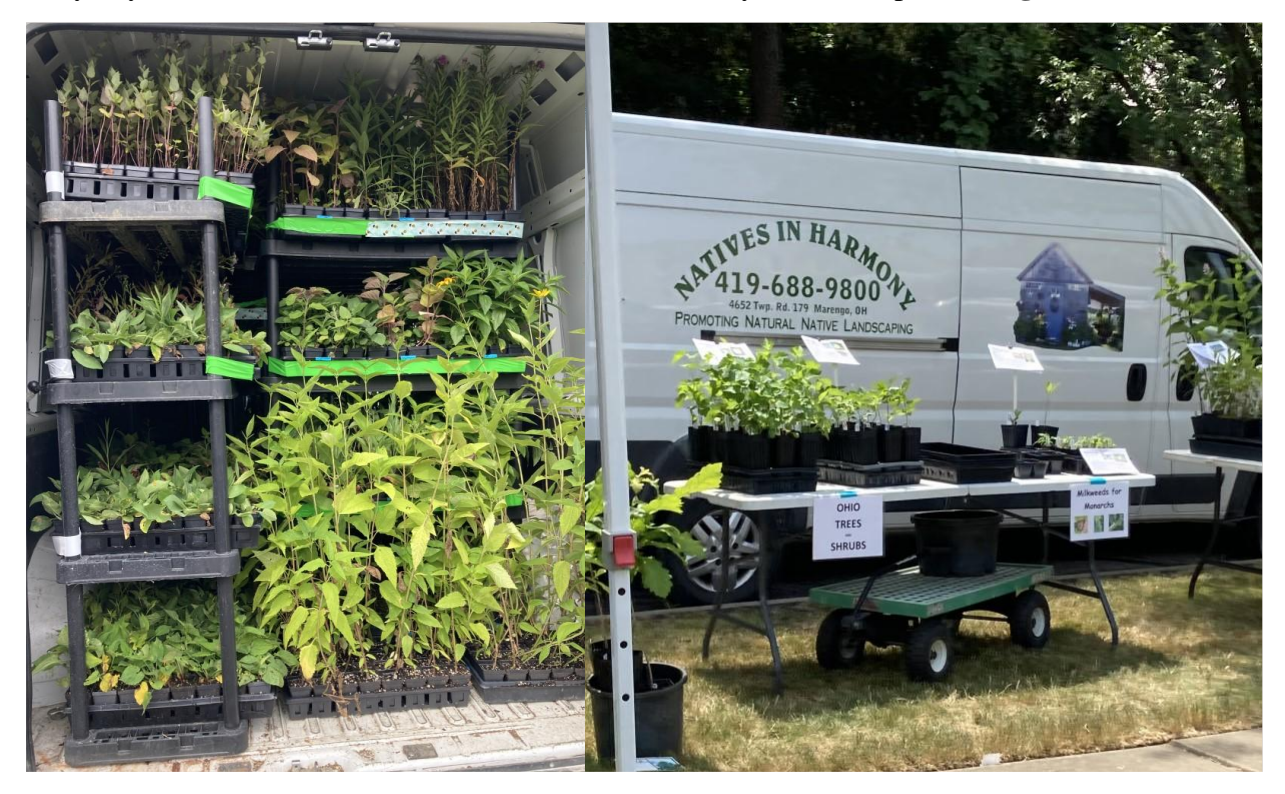
Figure 9. Plant delivery.

This includes product diversity and the ability to deliver plants ( Fig. 9 ).